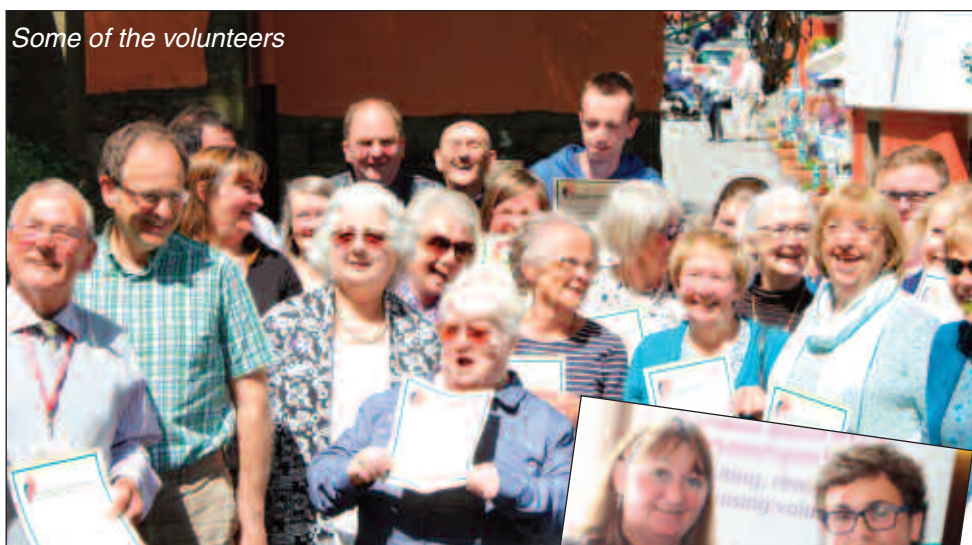
Some of the volunteers