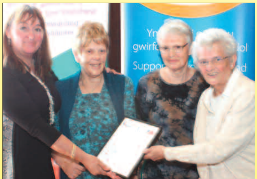
Gwynedd Guide Dogs